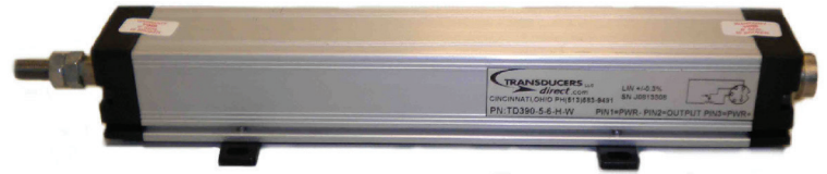
SERIES: TD390 (6 to 56" stroke lengths)